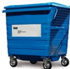
Dimensions in millimetres